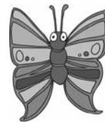
Butterflies 2 1/2 - 5